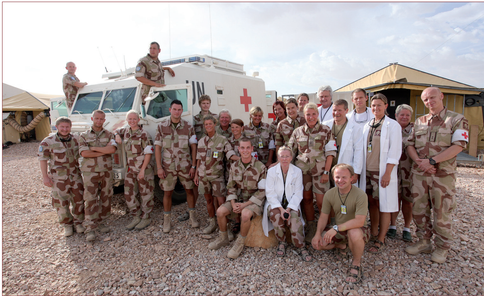
Emergency room (ER) and evacuation unit (EU).