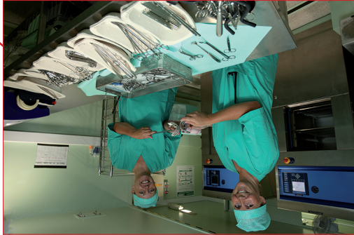
Central sterile services department (CSSD)