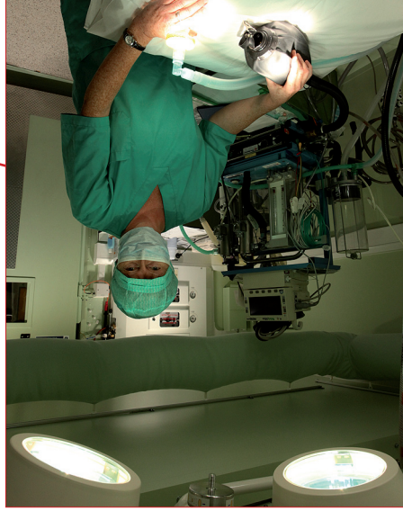
Operation theatre (OT)