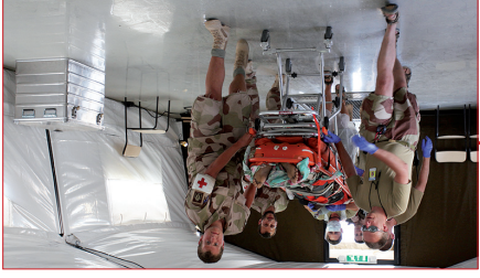
Emergency room (ER)