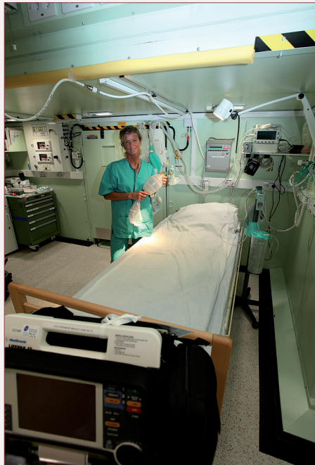
Intensive care unit (ICU).